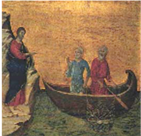
The calling of the disciples

T HEY WERE NOT the kind of group you might have expected Jesus to send forth on his mission to reach the world. There was nothing special or spectacular about them. They were just ordinary working men. But Jesus formed them into the backbone of the church and gave them the most extraordinary task imaginable: calling the entire world, including the mightiest empire ever known, to repentance and faith in the risen Christ. You can be sure that any educated, first-century Roman citizen would have laughed at any prediction that within three centuries the Christian faith would be the official faith of the empire.